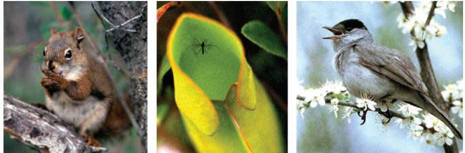
Adaptive animals. The Yukon red squirrel ( Tamiascus hudsonicus ) (left), the pitcher-plant mosquito ( Wyeomyia smithii ), shown descending into its carnivorous host, Sarracenia purpurea (middle), and the European blackcap ( Sylvia atricapilla ) (right) show genetically based shifts in the timing of their seasonal reproduction, dormancy, or migration during recent, rapid climate warming.

Although the specific adaptations of these animals to climate change are as diverse as the organisms themselves, they all involve genetic